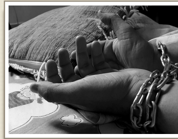
Combating human trafficking