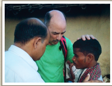
Praying with those in need

SGI provides you with the information you need to know that your giving is making an impact on eternity. We free up your valuable time by doing the 'leg work' for you. Requests for help can be overwhelming. SGI helps you to feel satisfied that you are being a faithful steward over what God has made you responsible. We help your giving to be more intentional, better focused, and less reactive.