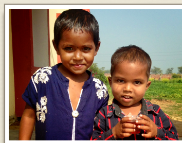
Caring for orphans