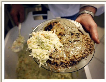
Feeding the hungry

We listen as you identify your top areas of interest. SGI will position you to engage those organizations that mean the most to you. This means you can have a meaningful connection to the work and people you support. Not only will you enjoy supporting your favorite organizations, but you will know what is happening in each of the ministries you support.